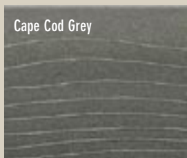
Cape Cod Grey